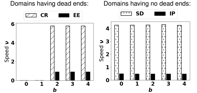
Figure 4: Speed to success \nu averaged over all of the jobs, for different values of search breadth b .

amount, the speed to success , which we define as follows: